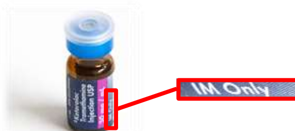
Figure 1. Ketorolac vial 2024

As indicated in the Advisory Operations 2014 – 07 (attached) , while the label on Ketorolac vial indicates the medication is for intramuscular (IM) use only (Figure 1), Sunnybrook Regional Base Hospital (SRBH) advised that Advanced Care Paramedics could continue to administer the drug both IM/IV per their medical directives.